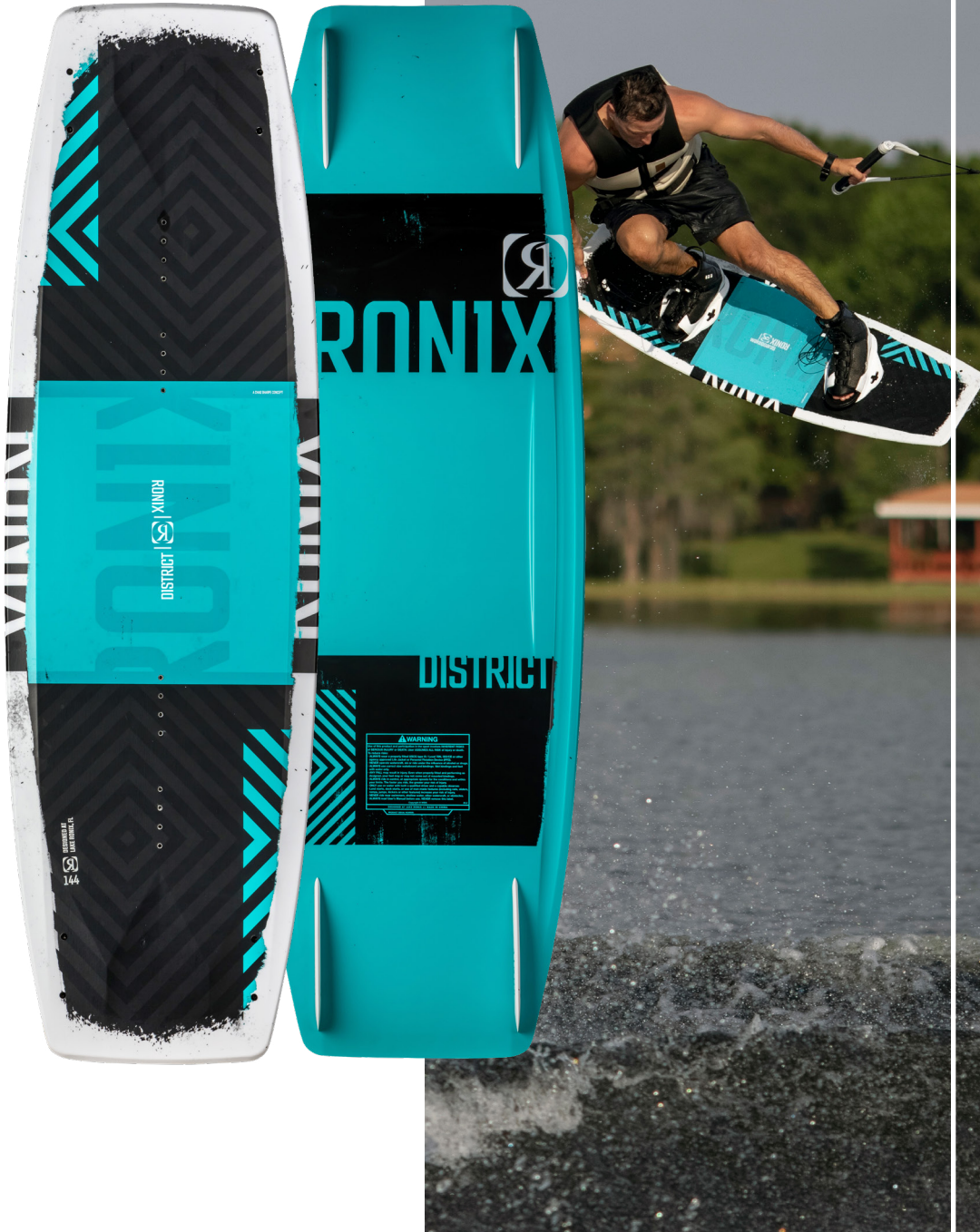
CHAD SHARPE PRO MODEL